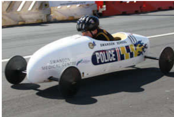
The Waitakere Rotary sponsored DARE Soapbox Derby car

Luke's opinion? It is a win/win situation. Continuation of the programs by Police is now assured and Bluelight, who receive good support from Police management, gain a very worthwhile program to run.