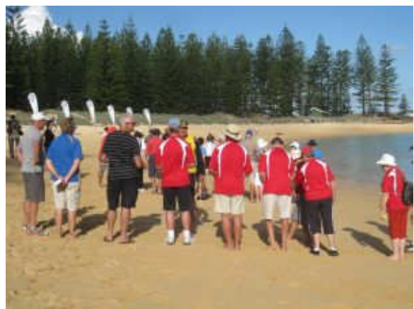
"The World Championship Beach Bowling Event"