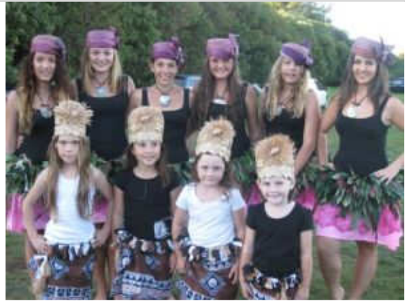
Local girls waiting to participate in the 'Rotary Goes Mainstreet' parade.