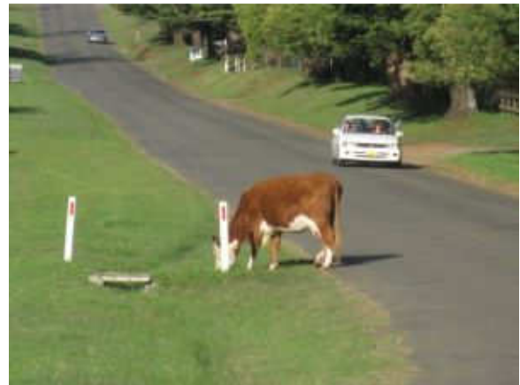
Local road – with typical wandering cow!