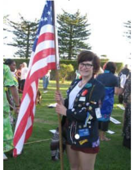
Our IYE Morgan ready to participate in the International Parade.