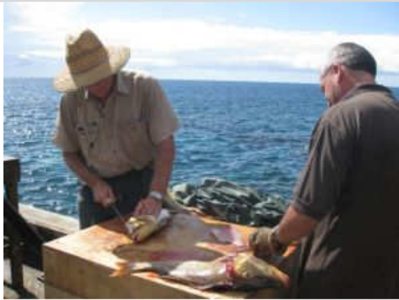
Fish, fresh off the boat, for our dinner