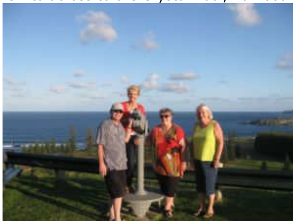
Car Rally Team with obligatory photo overlooking Kingston