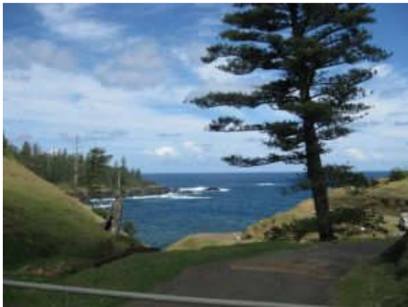
View to across to the Crystal Pool, Bamboura

The 2013 Rotary District 9910 Conference was amazing – inspiring keynote speakers, a wonderful venue, great weather, lots of social events which gave time for great fellowship, and a chance to really relax and unwind in a little piece of paradise! (Where else do you have a maximum speed limit of 50 kph – 40 in town – and cows, chickens, and 'wild critters' always have the right of way!)