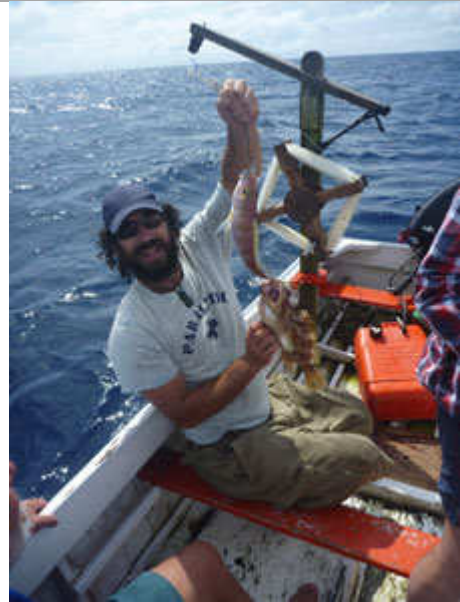
And others just fish their way out of there