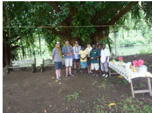
The first team arrive at the school