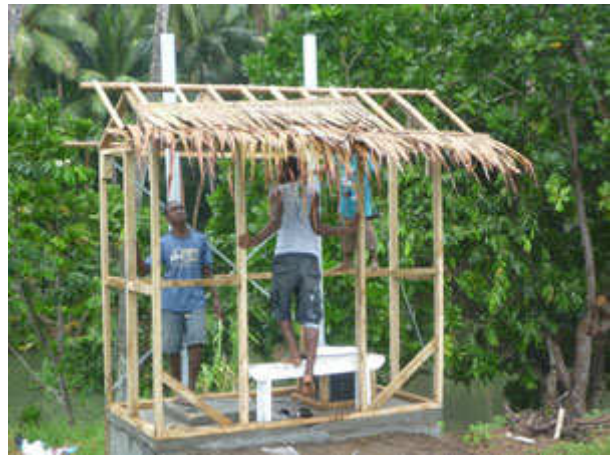
The thatched roof going on. A good thatch and bamboo walls last 25 to 30 years. The vertical pipes at the back remove the smell