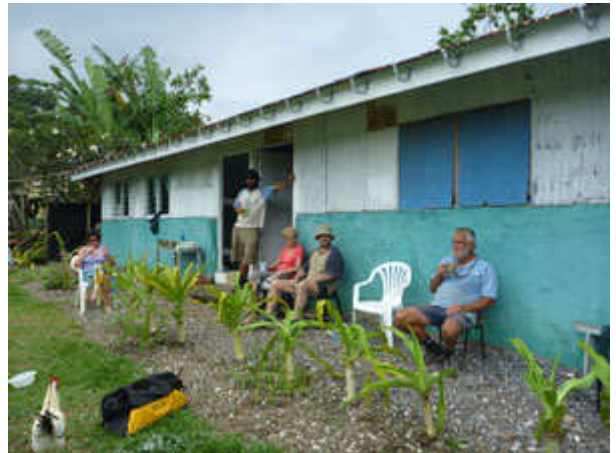
Siesta time in the heat of the day