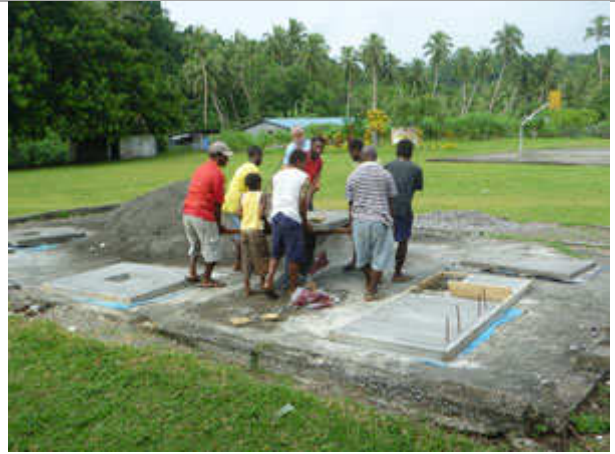
Carrying the slab – to the far end of the field