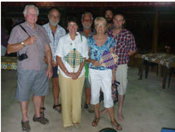
The group reunite for a last photo