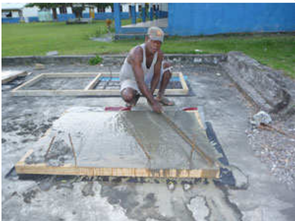
Slab construction on a spare, unused as yet, concrete floor