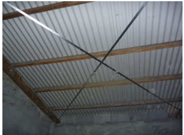
And adding roof bracing