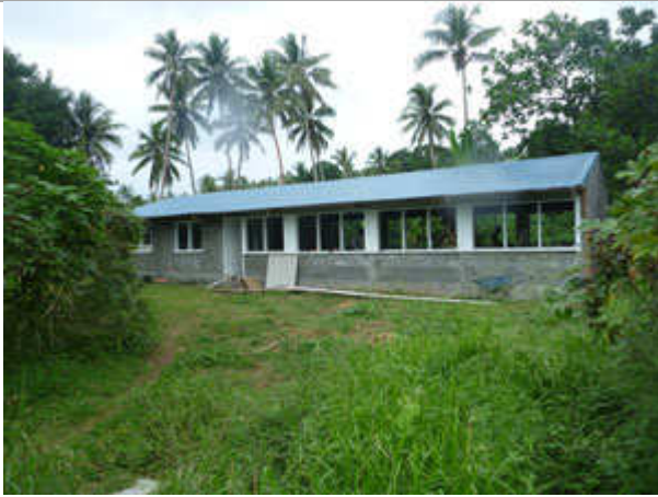
The front wall well on the way to completion