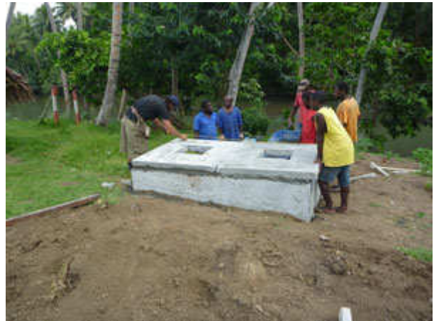
Tank with lid