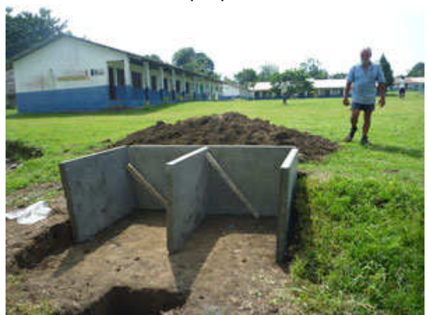
Walls in approximate position