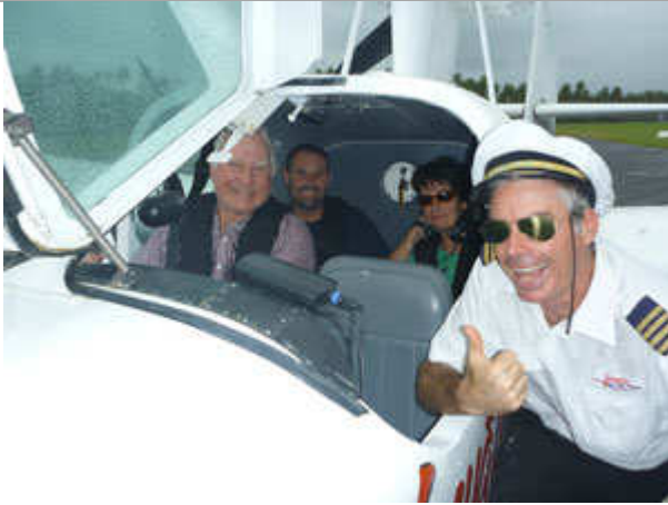
Some by plane