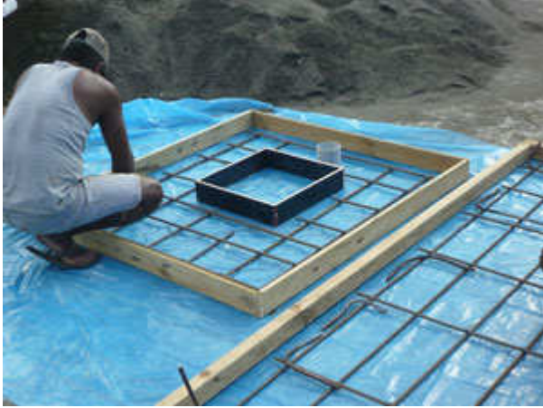
Building the framework

Many of the locals turned out to assist keen to learn how to do it themselves. A printed copy of the manual was left for the villagers to refer to in the future.