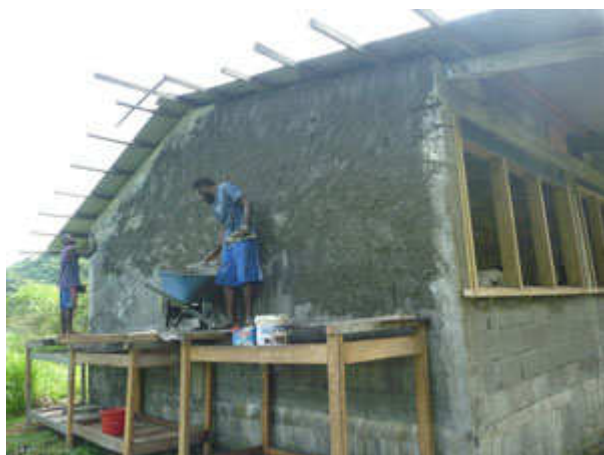
The far end wall – with exposed untreated purlins. These were later cut off and the iron flashed.