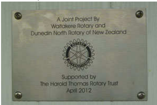
The plaque on the wall

With the assistance of some Dunedin North Rotarians, one or two other friends and keen to learn locals the dining hall is now well on the way to completion and, as a bonus, a new composting toilet has been constructed and the water supply is somewhat better thanks to the money provided by the Harold Thomas Rotary Trust.