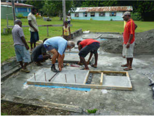
Four days later Kerry turns up to start supervising the moving of the slabs