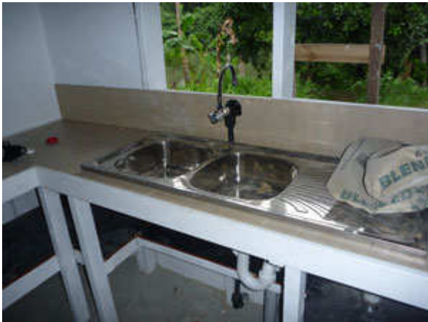
The sink installed