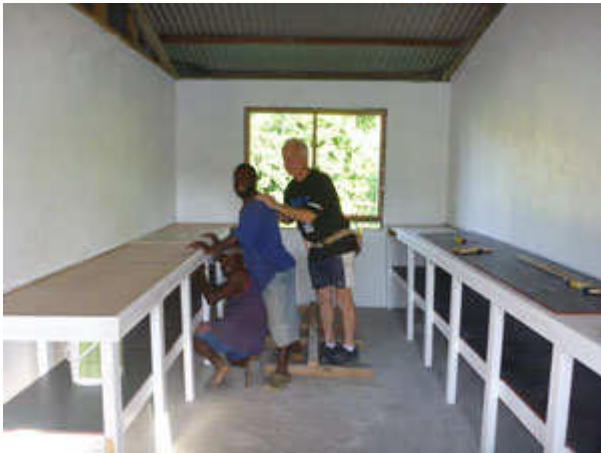
Craiger showing the Principal Louie the benches he had constructed and tiled prior to the sink installation