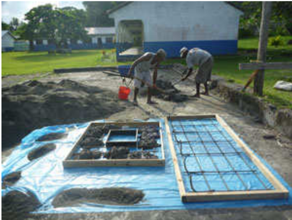
Pouring the concrete