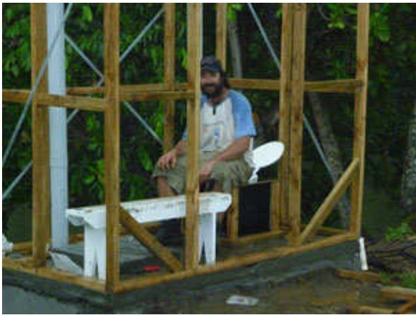
"That's better. A seat!"