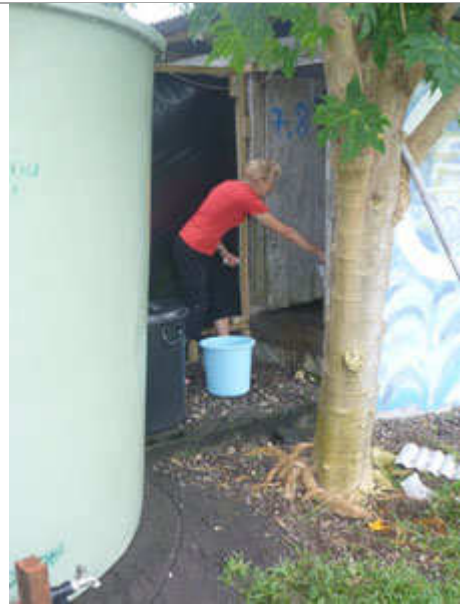
Ablutions – go then chuck a bucket of water at the hole to flush it