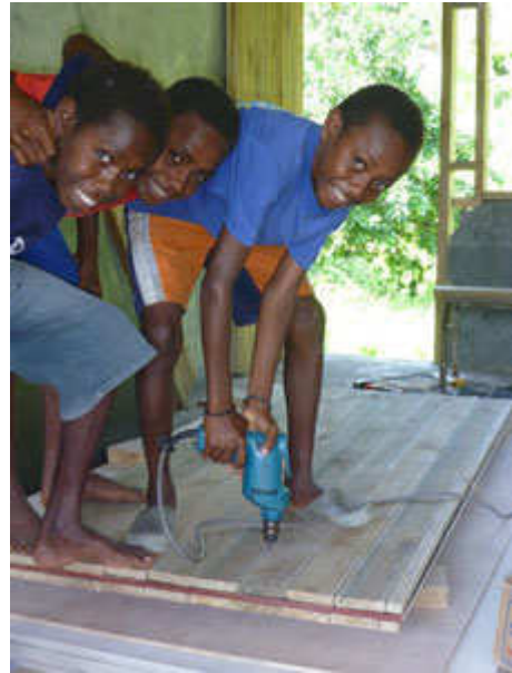
Door construction – and introducing the local kids to an electric drill and putting them to work