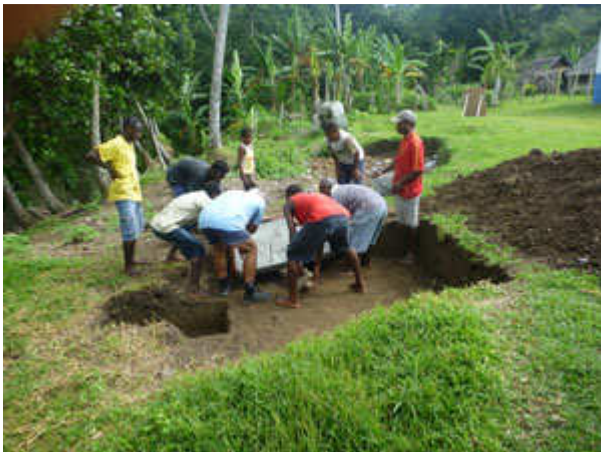
The slabs were heavy and took a team to move them into a prepared hole