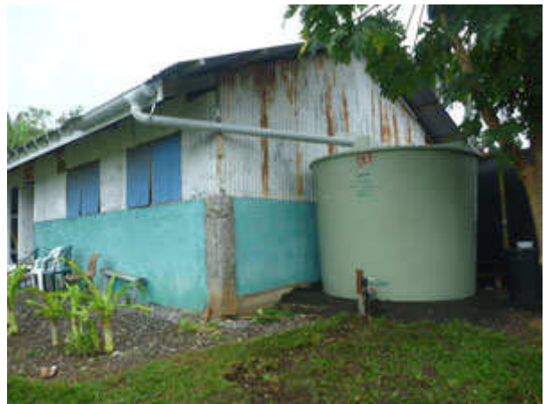
Water supply. Many of the roofs are as rusty as! The boys installed a new 2 metre stretch of roofing on an existing building at a high point on the school grounds (gravity feed for dining hall) and installed a new tank with pipes leading to stand pipes outside the dining hall, cookhouse and dorm.