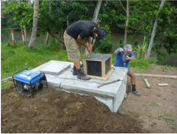
Thunder box installation. Once one tank is filled this tank is closed off and the seat moved to the other tank. When that fills the first tank is shovelled out as good useable compost