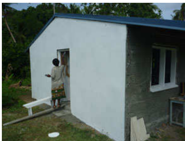
The other end wall complete after plastering, painting and flashing.