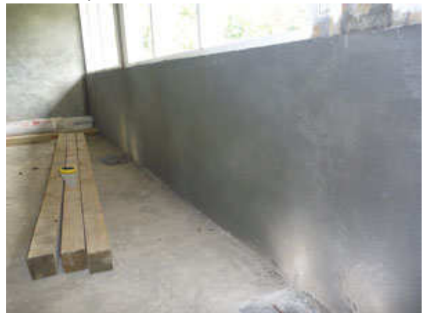
The walls freshly plastered