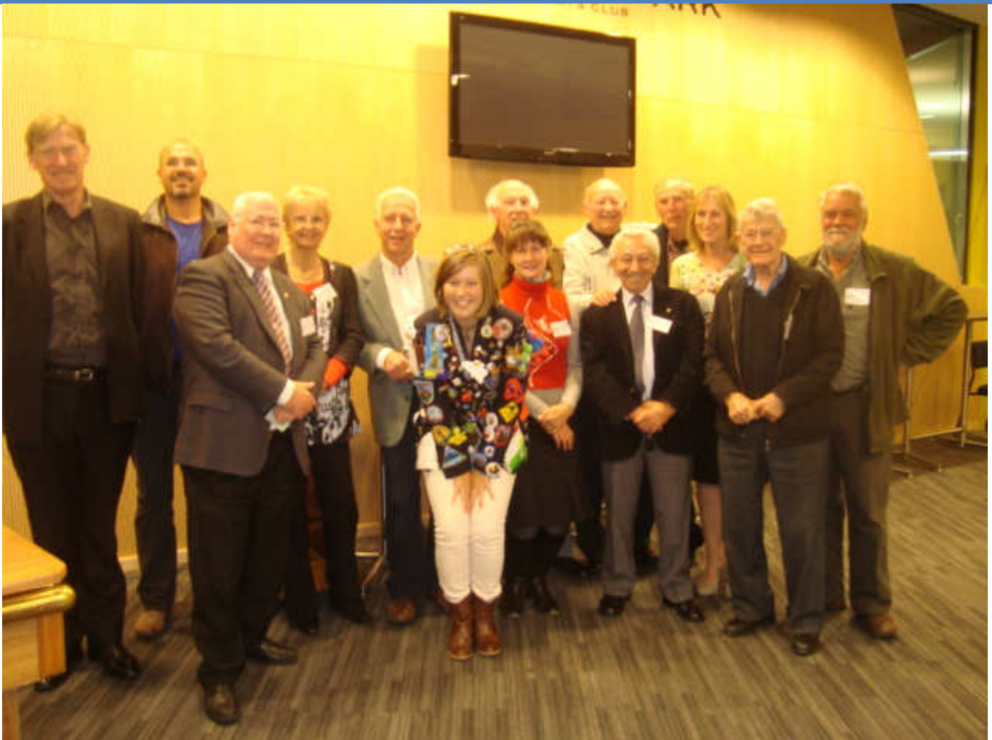
Our Rotarians (excluding those who were missing for one reason or another tonight)