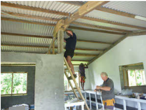
Fixing up the roof trusses