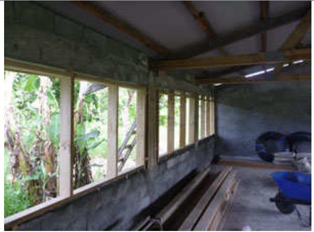
Framing up the windows