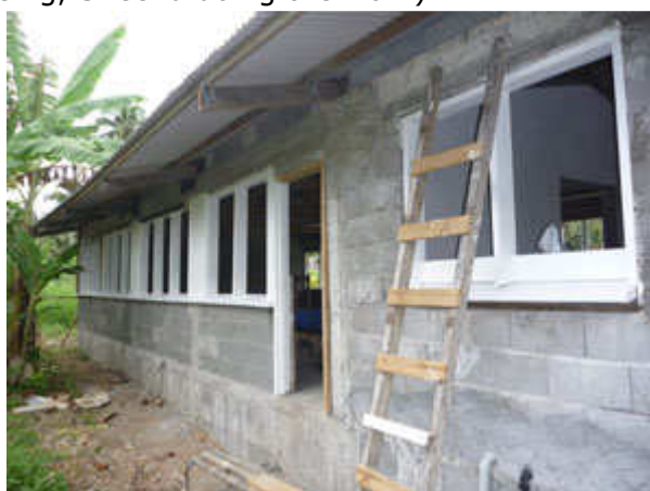
The rear wall with painting completed by Sheena and the kids