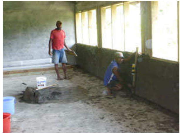
A few of the locals are excellent plasterers