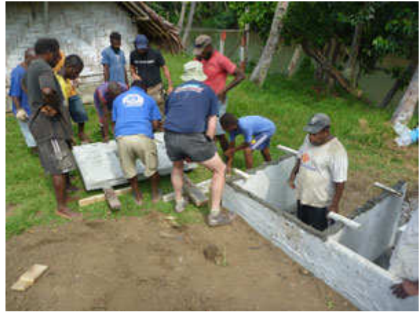
Next day - now for the roof of the tanks

The liquid drains from the tank through the pipe into the gravel bed leaving the solids in the tank