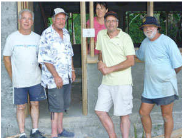
"Right. We've put the Rotary plaque up... now where do we start?"