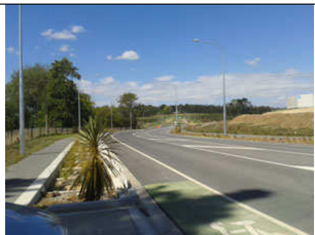
Half way up looking down the road