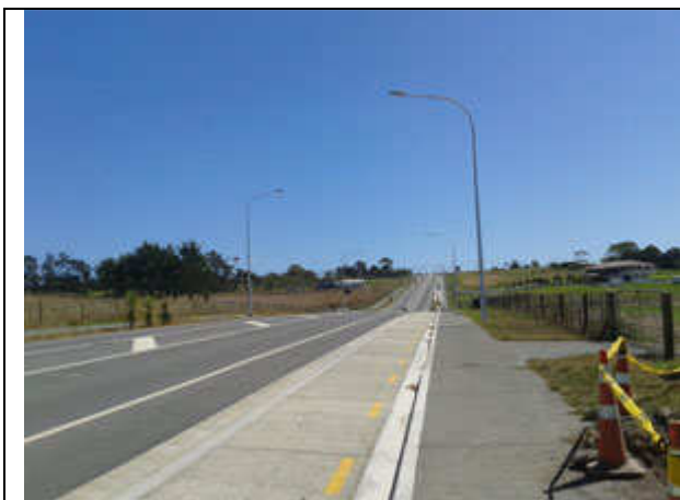
Half way down looking up the road

I have spoken to the site office and two of the three residents (3 rd one not at home). The reaction from those I spoke to were "OK, but be aware our trucks etc are using it for lower access" and "Sounds like fun and we'll enjoy watching the teams - but make sure we can get in and out if we need to"