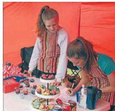
Cupcakes: Massey High School students hold a stall to raise money for a school trip.