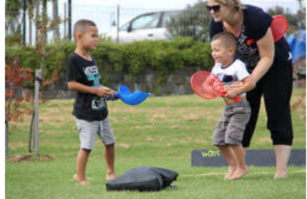
Thank you to in2it for providing extra activities for the children