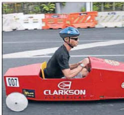
Big kid: Between children's races, adults got to try out one or two larger cars.