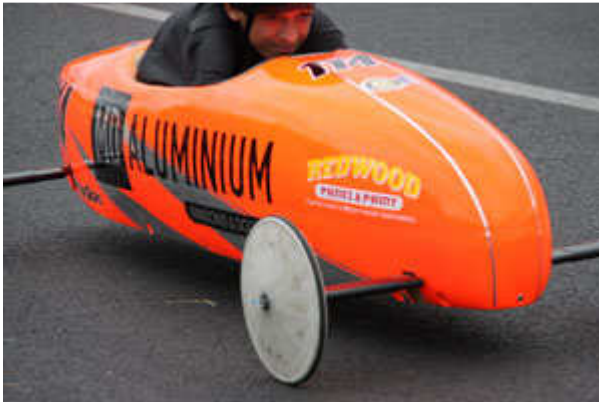
The Waitakere car that raced to victory