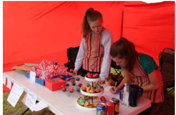
Many thanks to the 6 teams from Massey High who helped feed everyone