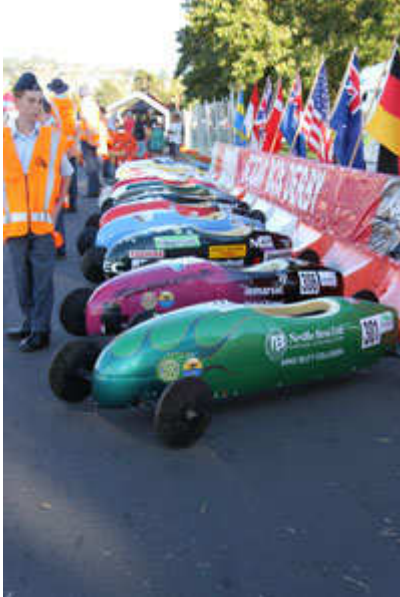
2014 cars lined up ready to race

These will be held on Sunday 29 th March 2015 on Brightside Road in Whangaparaoa.