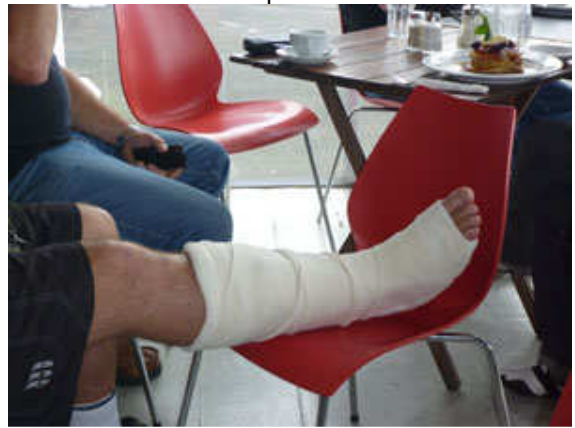
... Complete with broken ankle courtesy of the East Coast Rotary sailing trip last Monday