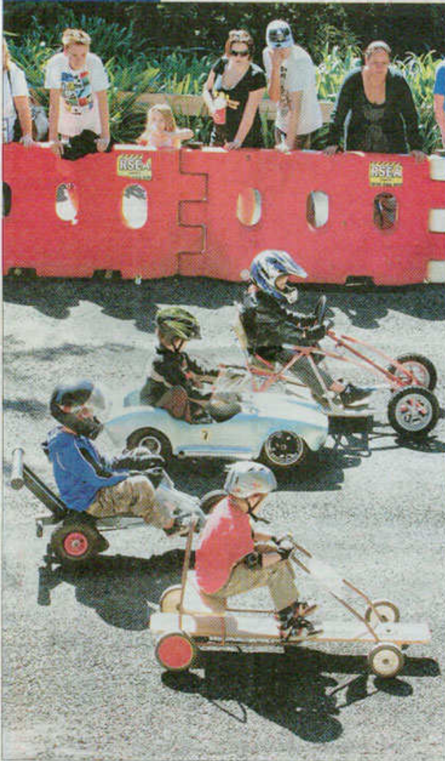
Vehicles of all shapes and sizes get a thorough workout as they are raced down Grantham St, Hamilton in the popular Bluelight Trolley Derby.