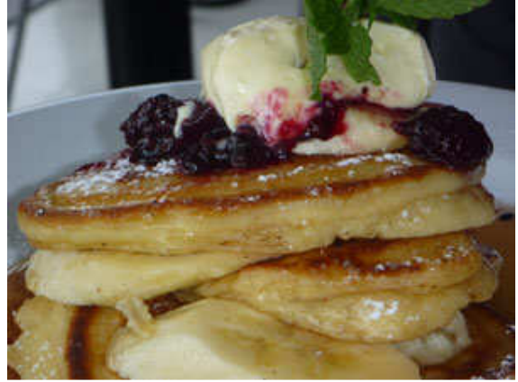
...And a closeup of the breakfast