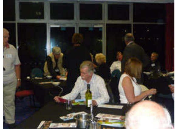
The room humming with chat