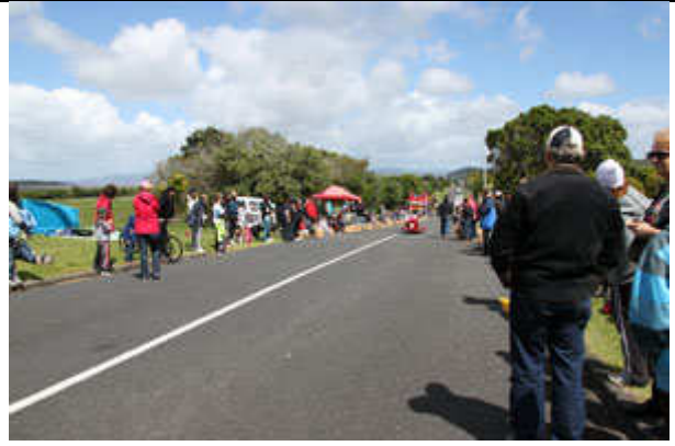
The track – slightly steeper than it looks in the photo