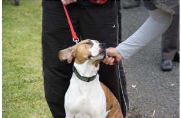
A few dogs turned up in support and to make new friends.