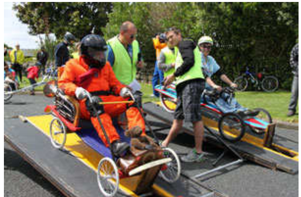
The Salvation Army cart on left came complete with airhorns and teddy bear mascot