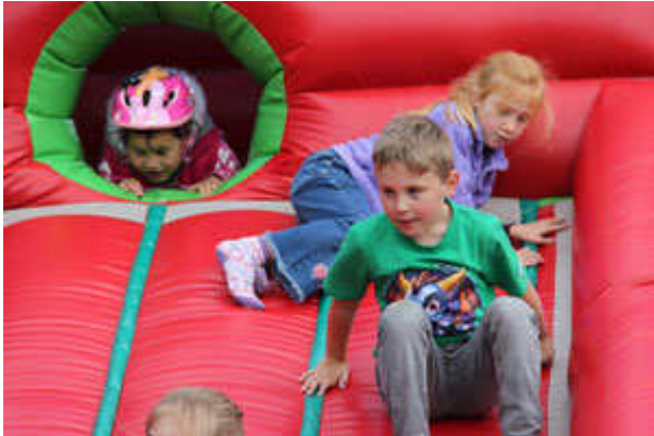
The bouncy castle was well used