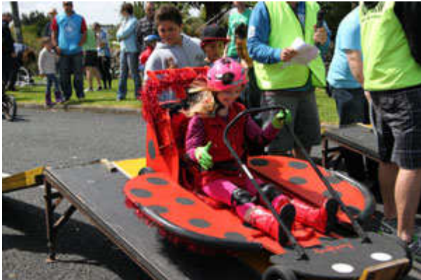
Came in looking like a cart – then folded down to become a Ladybug