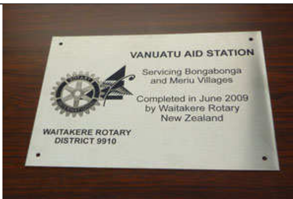
The sign for the Aid Station – black on silver plate.