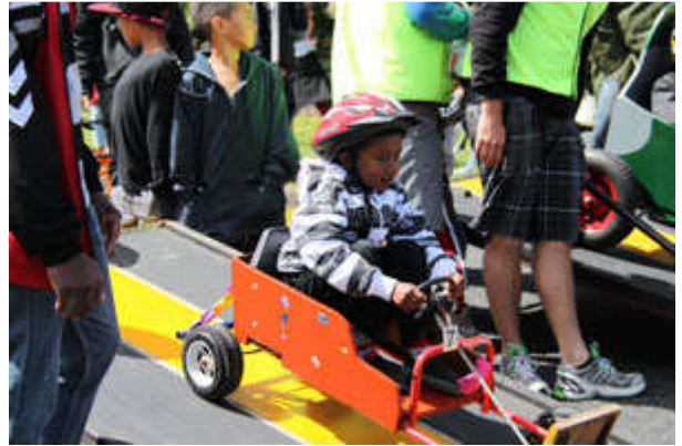
Our starting ramps have never seen anything quite this small!