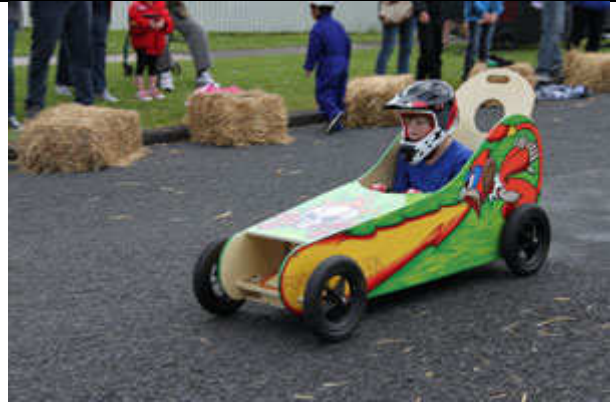
This style cart was designed recently by the Nelson Trolley Club