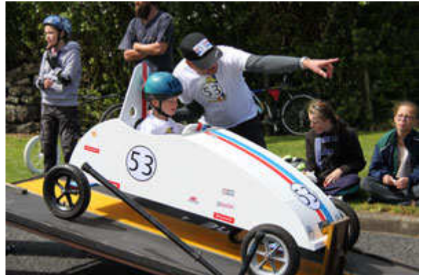
Serious stuff here – even down to corporate uniforms for Dad and son