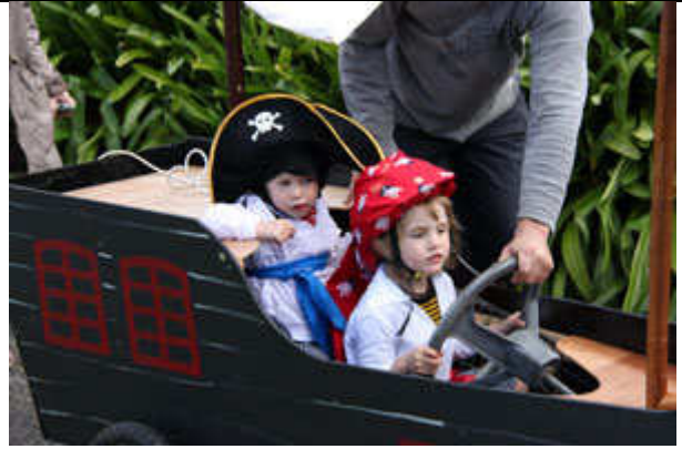
Mum also had a go in the Pirate ship in the Monarch class