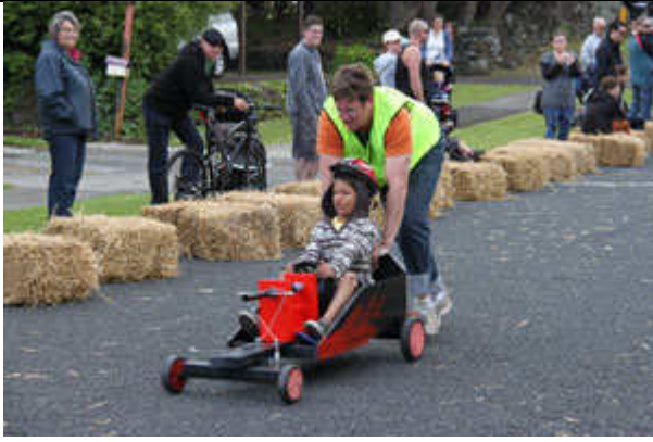
Small wheels make carts go very slow