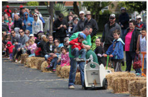
Oops! There were a few "incidents" involving hay bales.