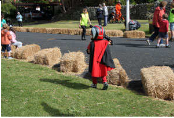
A lot of kids dressed up for the event – seeing this cape flying in the wind was pretty cool